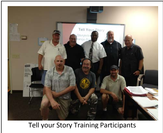
Tell your Story Training Participants

Community Roundtables build capacity to connect, support, and empower consumer, families, parents, caregivers, youth and children. UACF’s approach ensures that regardless of background, participants are recognized as equals in their roles and responsibilities in local mental health outreach. The Roundtables also serve as a forum to coordinate a statewide public awareness campaign with CalMHSA and other program partners, as well as engage counties to enhance existing efforts, share best practices and successes. Roundtables have been held in Los Angeles and San Diego, with around 60 participants in each location. The roundtables allow UACF an opportunity to partner with community-based organizations and reach diverse groups to ensure the continuation of effective policies, strategies and practices. Some of the groups reached by UACF’s efforts include underserved ethnic populations, geographically isolated groups, LGBTQ, Native Americans, Veterans and transition age youth.